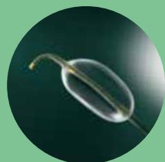
Copernic 2L Double lumen balloon microcatheter