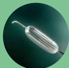
Eclipse 2L Double lumen balloon microcatheter