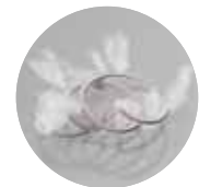
CIRRUS (with fibers)